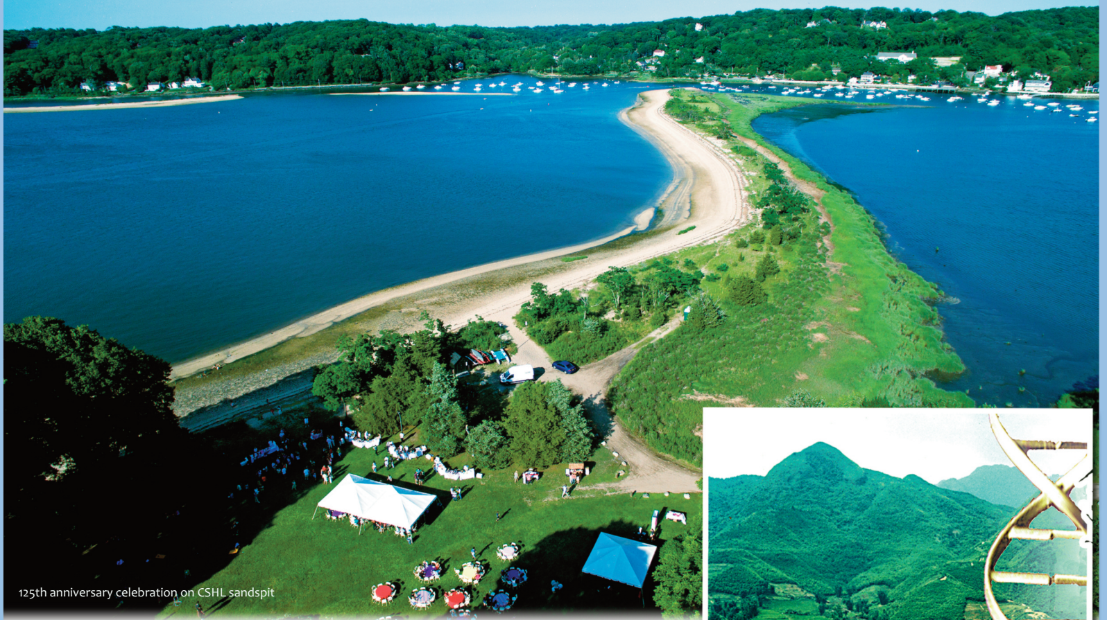
125th anniversary celebration on CSH sandspit